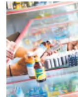
Consolidated net profits of top pharma firms in Q3 doubled from a year ago.

Sun Pharma posted domestic sales of ₹2,753 crore, up 9.4% from a year ago as India's largest drugmaker, aided by